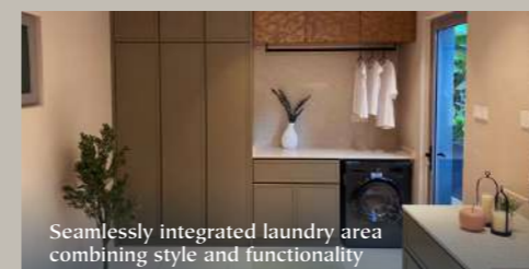
Seamlessly integrated laundry area combining style and functionality