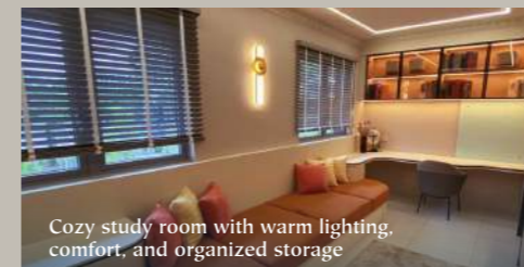
Cozy study room with warm lighting, comfort, and organized storage