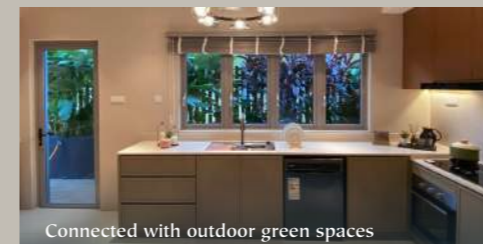
Connected with outdoor green spaces